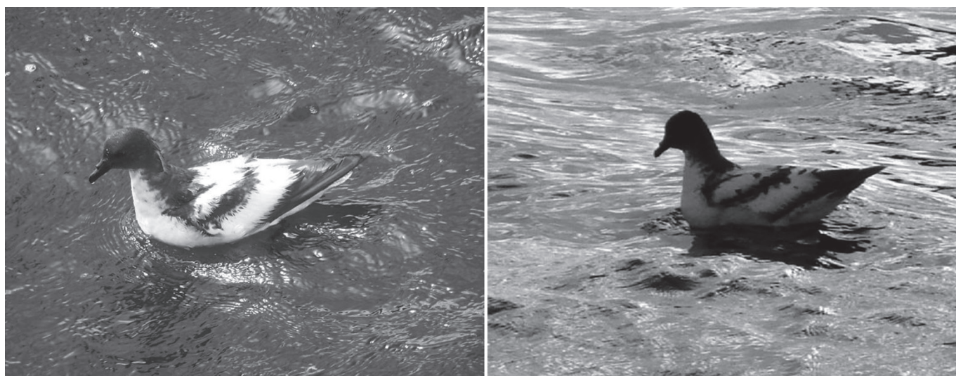
FIGURE 4: Leucistic Cape Petrels, Daption capense , recorded in Uruguay in 15 December 2005 (left) and 16 December 2007 (right).

There are several kinds of colour anomalies in birds, while in procellariiforms, cases of leucism, albinism and melanism have been recorded (Bried et al. 2005). Among the albatrosses these anomalies have been reported in at least five species: Wandering Diomedea exulans , Shy Thalassarche cauta , Laysan Phoebastria immutabilis , Black-footed Phoebastria nigripes and Light-mantled Phoebastria palpebrata Albatrosses (Fischer 1972, Lepschi 1990, Bried