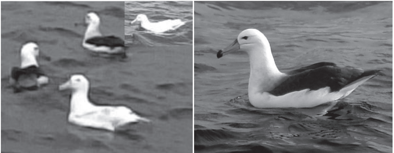
FIGURE 1: Leucistic Black-browed Albatross, Thalassarche melanophris , among two other individuals of the same species (left). Detail picture above shows the bill colour, characteristic of juveniles. At right a picture with better resolution of a juvenile of the same species with normal plumage.

One albatross and one petrel showing aberrant plumage coloration were photographed by Sandro de Mello Terroso while aboard a fishing vessel operating off southern Brazil during July-August 2008. In waters off Uruguay, Fernando Area photographed one aberrant-plumaged albatross in August 2007, and S. J. photographed two petrels on 15 December 2005 and 16 December 2007. On 26 May 2007, Trevor Hardaker photographed one albatross with aberrant plumage off Cape Town in South Africa.