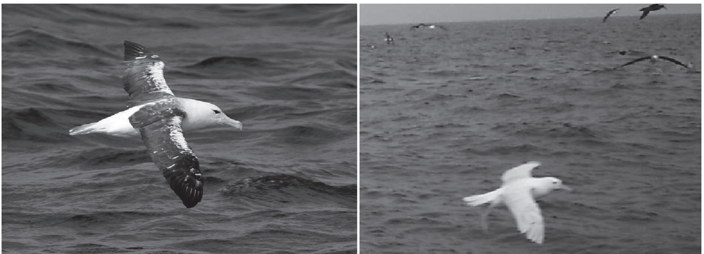
FIGURE 2: Leucistic adult Black-browed Albatross, Thalassarche melanophris , photographed in May 2007 in South African waters (left). On the right a juvenile of the same species recorded in Uruguayan waters in August 2007.

Adult Black-browed Albatrosses are mostly white with black wings and grey tail and have orange bill with reddish-tip. The juveniles are similar, but the olive-brown bills become lighter with age, retaining a dark tip (Figure 1). Adults and juveniles have a dark eye patch and brown iris (Onley and Scofield 2007). The leucistic